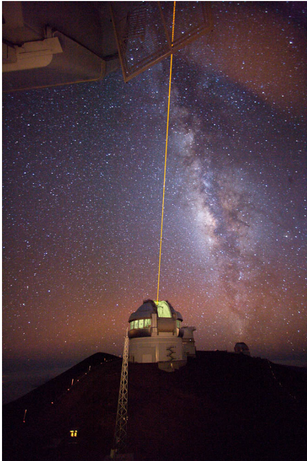
Gemini North Laser Guide Star (LGS) System