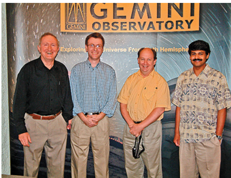
The WFMOS team after their presentation to Gemini.