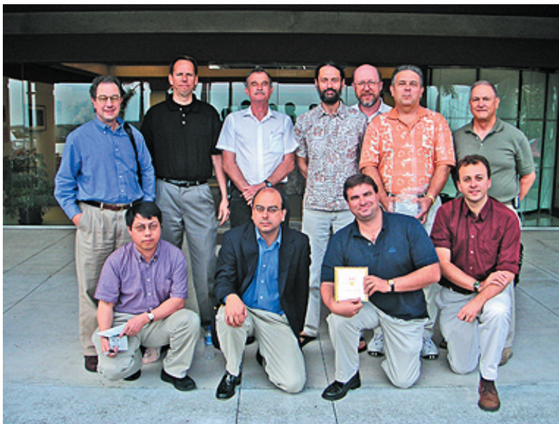
The NOAO/University of Florida HRNIRS team outside the Gemini Headquarters building in Hilo, following the review of their conceptual design study.