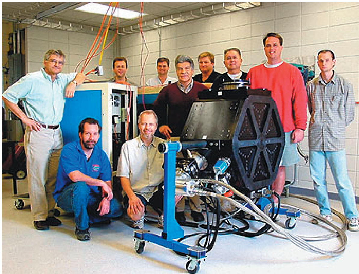
The T-ReCS Team appears with the completed instrument.