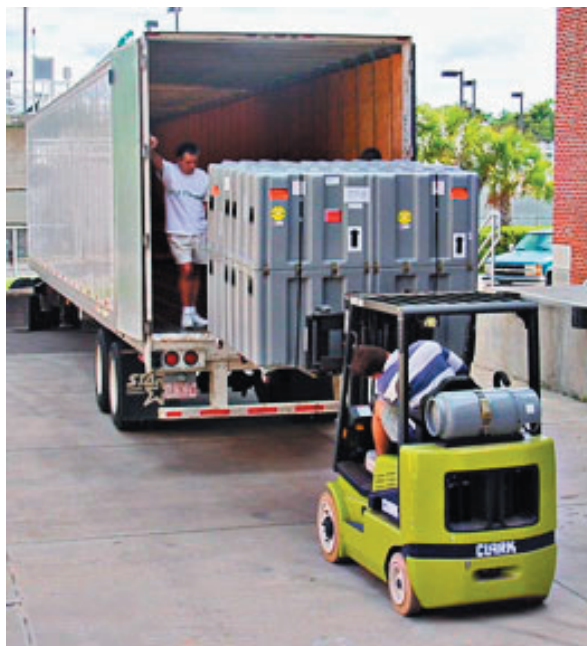
T-ReCS being lifted onto a truck at the University of Florida for its trip to Cerro Pachón (9 April 2003).