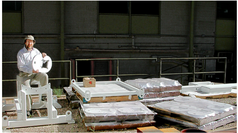
Phoenix instrument scientist Ken Hinkle sits on the handling frame for mounting Phoenix on Gemini, holding one of the 60-pound steel counter weights. The pallets to the right hold additional counter weights and handling equipment.

Phoenix will be offered to users starting in the 2002A semester. While Phoenix is a very good optical and scientific match to the 8-meter Gemini telescopes, it originally was designed for use on the 4-meter Mayall telescope at Kitt Peak. Similar in size and weight to other instruments on the Mayall telescope, Phoenix nearly fills the 4-meter Cassegrain cage and weighs slightly over a half ton. To be mounted on Gemini, Phoenix must match much larger weight and moment specifications, which require that about one ton of counter weights be mounted with Phoenix.