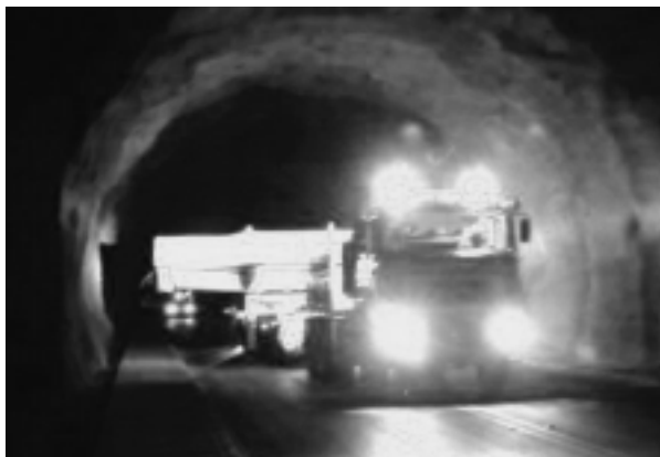
Passing through the Puclaro Dam Tunnel.