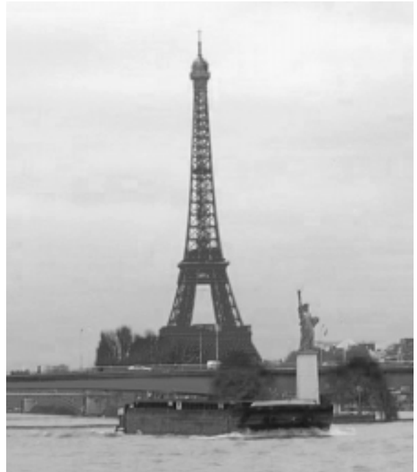
Aboard the transport barge on the Seine.

Early in the morning on March 15 th , the mirror successfully passed through the Puclaro Dam Tunnel, the narrowest constriction on the route from the harbor, on its way to Cerro Pachón where it arrived on March 17 th . The mirror now rests safe and sound within the coating chamber of the Gemini South enclosure. The mirror will see “first light” in the Gemini South telescope later this year.