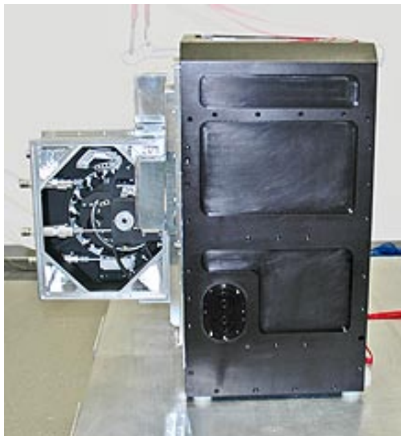
The NICI filter wheel assembly is shown being inserted into the NICI dewar, in preparation for the second cold test.

As of the end of September, MKIR reports that 93 percent of the work to NICI final acceptance by Gemini has been completed. NICI is expected to be deployed on Gemini South in 2005.