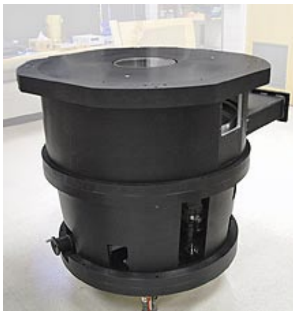
The FLAMINGOS-2 MOS dewar that contains the masks for multi-object spectroscopy and the spacer.

FLAMINGOS-2 is transitioning from the late fabrication phase of the project to the early part of the integration phase. Recent achievements include fabrication of the filter wheel and integration of the camera dewar components. As of September, 59 percent of the work to FLAMINGOS-2 final acceptance by Gemini has been completed.