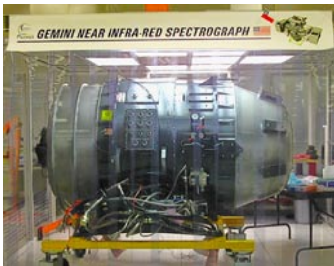
GNIRS in the Gemini Cerro Pachón clean room.