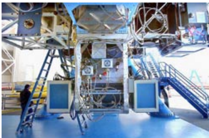
Michelle mounted on the up-looking port of Gemini North.

Optical work carried out thus far includes realigning the pupil and removing vignetting at the detector. A problem that has been identified but not yet addressed is detector thermal control. The detector temperature is currently too warm and the temperature stability not sufficient to minimize detector noise when Michelle is used for spectroscopic applications. Gemini has developed plans