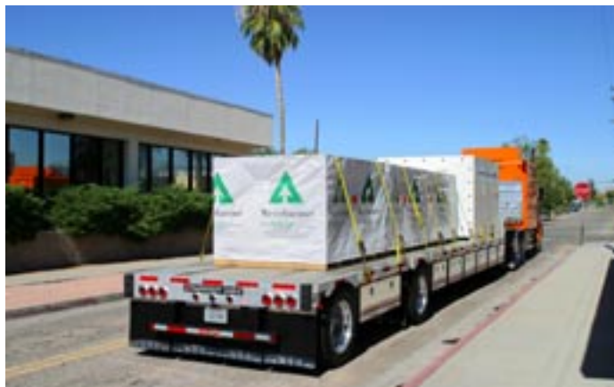
GNIRS leaving the NOAO facilities in Tucson for Chile.