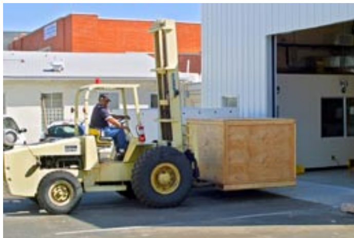
Crate of GNIRS electronics cabinets being removed from the NOAO Flexure Test Facility in preparation for shipment to Gemini South.