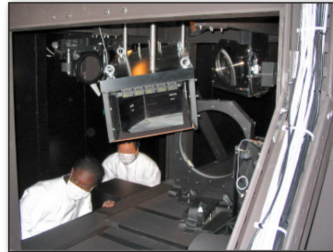
Alignment procedure for the bench echelle spectrograph in the Gemini South pier.

A sample reduced spectrum is shown above (top panel). The illustrated section of spectrum shows the 6707.8 Angstrom neutral lithium (Li I) line in the metal-poor halo subgiant HD140283 ([Fe/H]= -2.5). This spectrum results from two 20-minute integrations and has an unsmoothed signal-to-noise ratio of about 1000 with R=150000. The quality of the data can be noted in the residuals (bottom panel) of the observed spectrum minus theoretical spectrum, with no structure in the residual points.