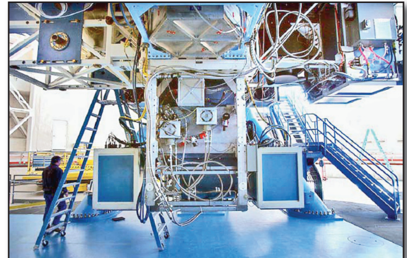
Michelle mounted on the up-looking port of Gemini North.